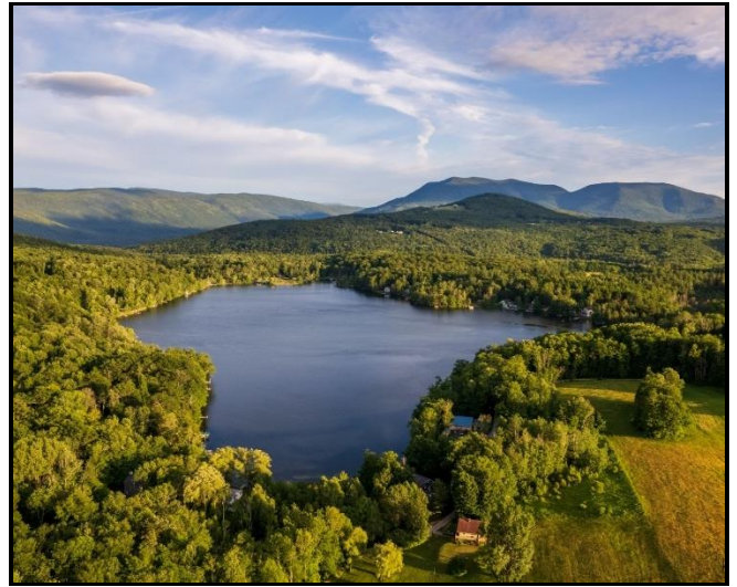
This is one of the prizes in the Tinmouth Pond Milfoil Project (TPMP) Fundraising Raffle

Thank you so much for helping your neighbors.