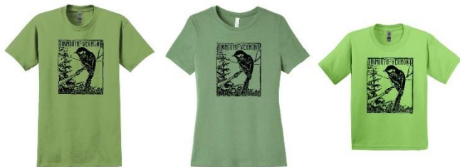
ADULT UNISEX - "KIWI"

I will send an email with details for pick up after the ordering window is complete and the order is placed with the print shop. I will set up a Saturday pick up at the Old Firehouse after the order is complete. Please feel free to reach out with any questions!