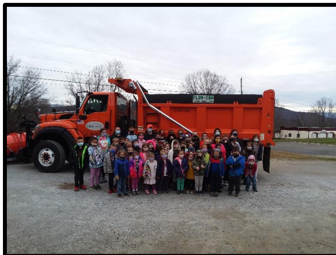
"Cow Plow" with TMS students