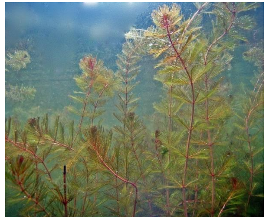
The photo pictured is invasive Eurasian Milfoil.

What should you know about Eurasian Milfoil? I will tell you. Eurasian isn't any type of milfoil; it's an invasive species that is good-for-nothing, really. They crowd space for native plants-(occurs naturally) Floating fragments quickly germinate to Milfoil in sky rocket time.