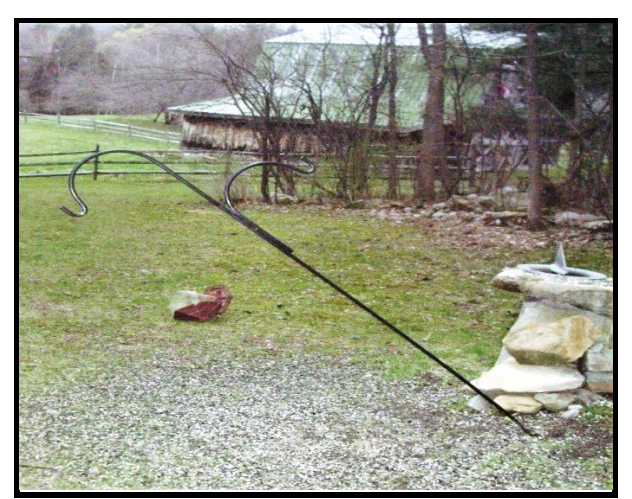
Vito's bird feeder!