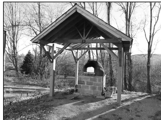
Bake oven under construction by Tinmouth volunteers