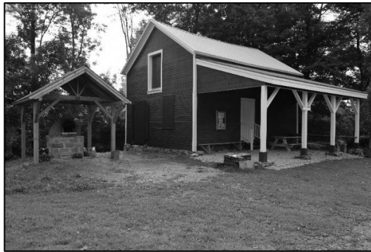
Old Creamery and Wood Fired Bake Oven (built summer 2017)