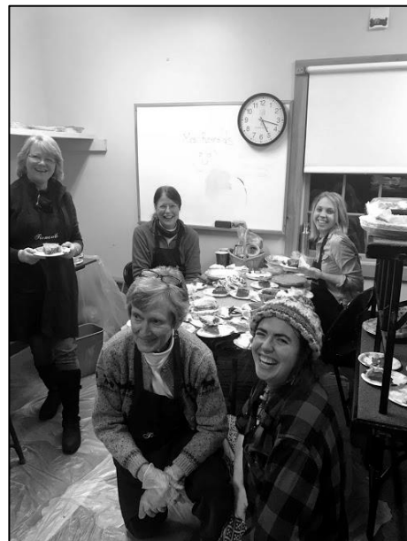
Annual Game Supper Pies & Pie room servers Thanks to all who donate to the success of the TVFD Annual Game Supper