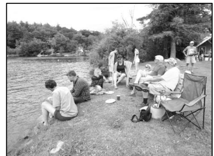
"Take Tinmouth to the Lake"