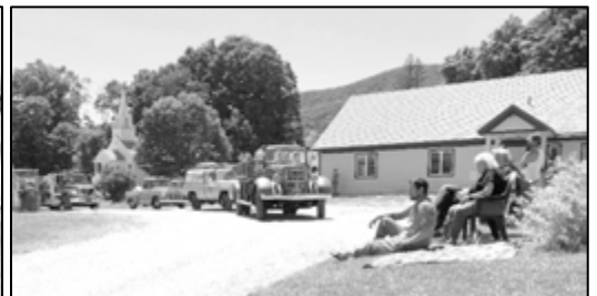
2022 Tinmouth Community Fun Day – Parade, games, events, music, and a delicious lunch for all.