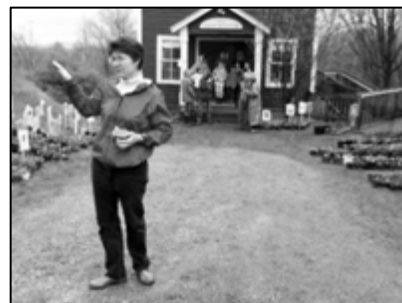
Plant sale 2014 and 2022