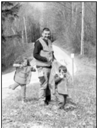
Springtime in Tinmouth Green-up Day volunteers and the annual Plant Sale