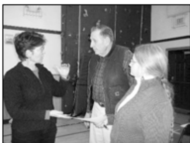
Town Meeting February 2018 and 2020

Her tireless efforts and enthusiasm to enhance Tinmouth's sense of community is greatly appreciated. We look forward to her continued energy and endeavors as she continues to serve in many of her other roles.