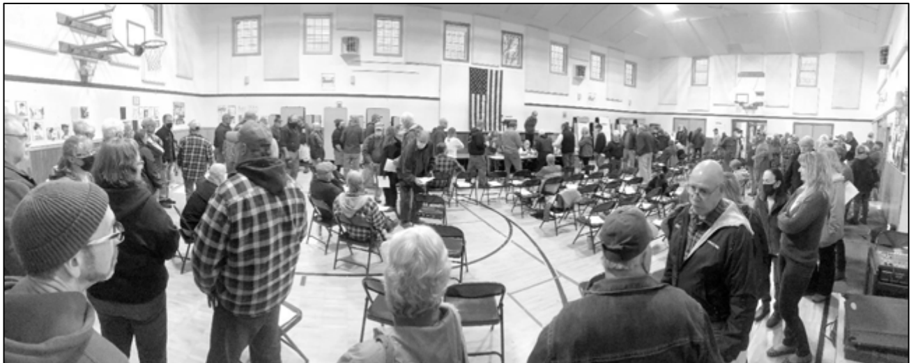
Special Tinmouth Town Meeting, May 2, 2022 Voted 72 to 35 to end traditional Town Meeting in favor of Australian Ballot voting

If you own property here, but live out of town, use your Tinmouth 911 address for your location.